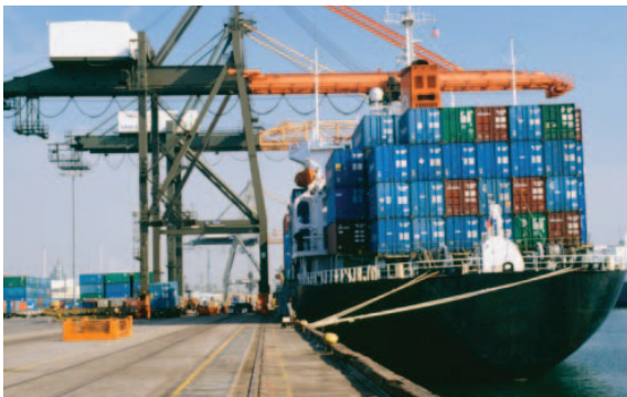
Reliable and dedicated communications for port security

ASTRO 25 has a complete line of portable and mobile radios.