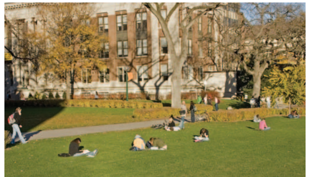
Campus and local police can work together to respond to emergencies